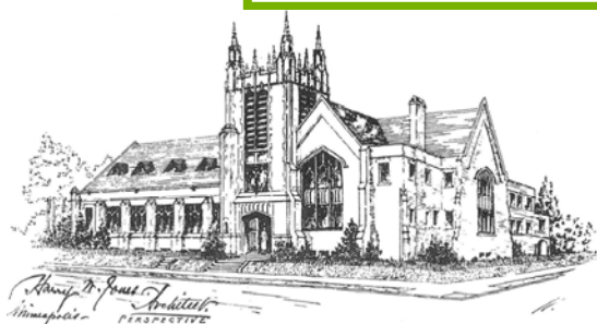
41st and Harriet Avenue South Minneapolis, Minnesota 55409