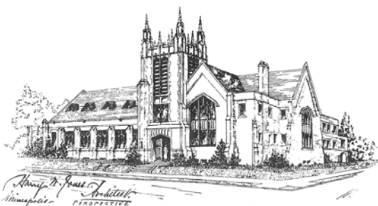
41st and Harriet Avenue South Minneapolis, Minnesota 55409