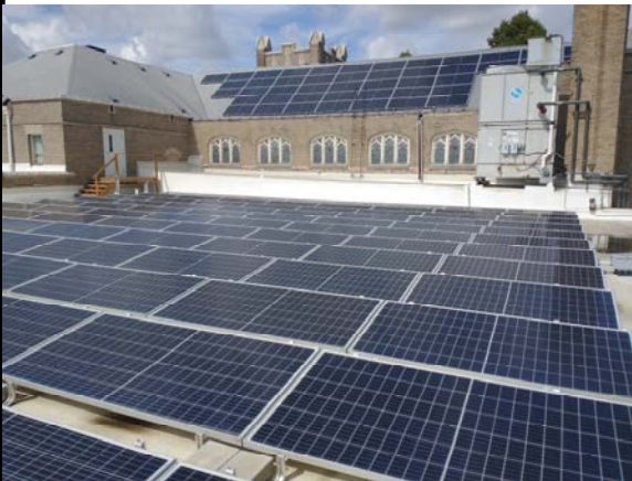
A view from the roof

“Judson Memorial is in an elite group. Despite solar energy being less expensive to produce now than coal or gas, the business plans of large utilities such as Xcel and the maze of incentives, make going solar a complicated process. It takes dedication and commitment from leaders. Of 100 congregations that MNIPL first reached out to in 2019 for this program, only six cross the finish line to install a solar array. Judson was the first.