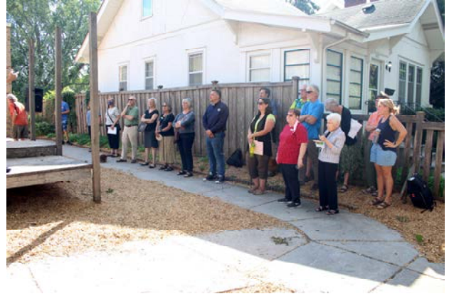
The lively crowd celebrating the dedication of our solar panels

September 19th brought the dedication of Judson Church’s new solar panels. With these we now generate 70,000 kWh annually, enough to power most of our daytime activities and even kick some back into the grid on sunny summer days. This is a major step forward for our commitment to better environmental stewardship.