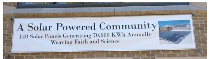
Judson's new banner