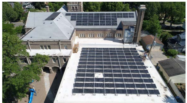
Drone footage of the 140 solar panel array

In the age of climate crisis, which is not only making the long-term poor and needy more vulnerable, but also putting the lives of all people more at risk, the act of shifting our energy use to zero-carbon sources is every bit an act of mercy as feeding the hungry, clothing the naked, and visiting the sick. It may not look like our typical picture of Jesus, but it is walking directly in his footsteps.”