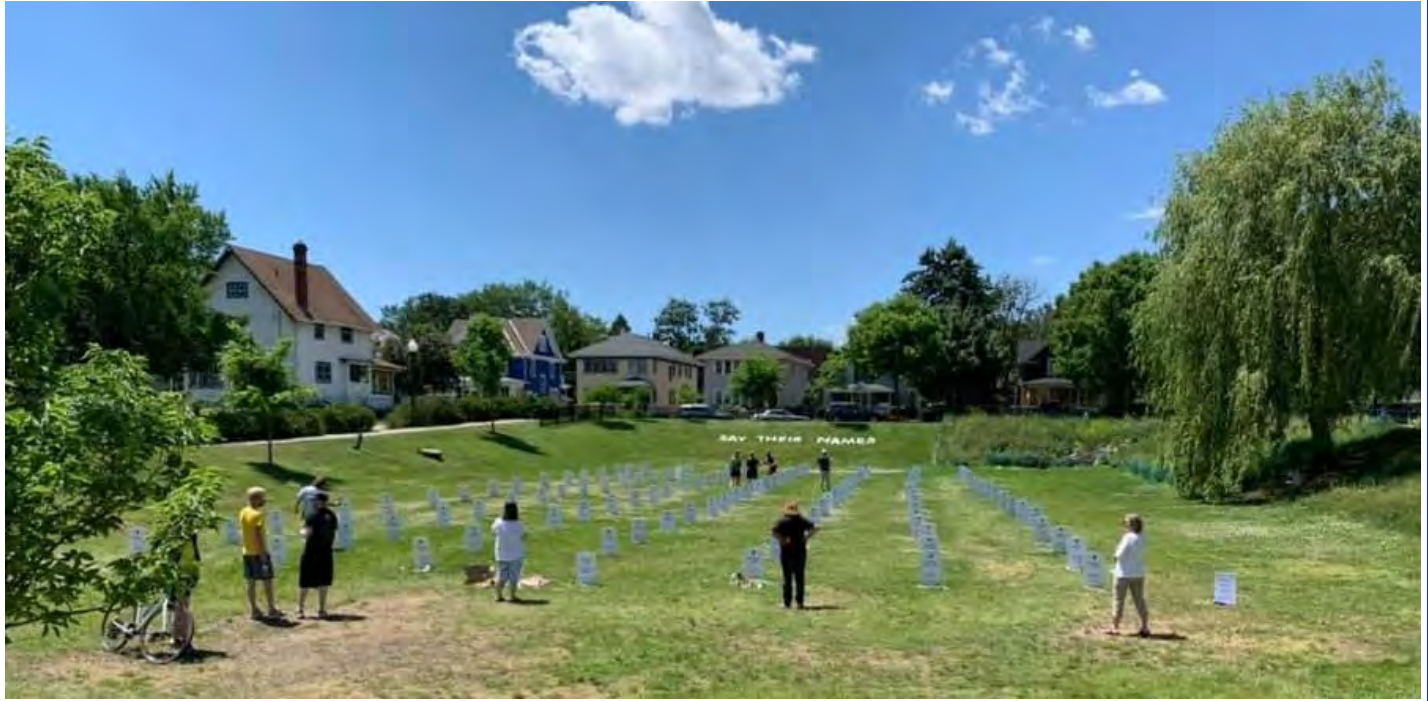
Say Their Names Memorial (37th St. & Park Avenue)