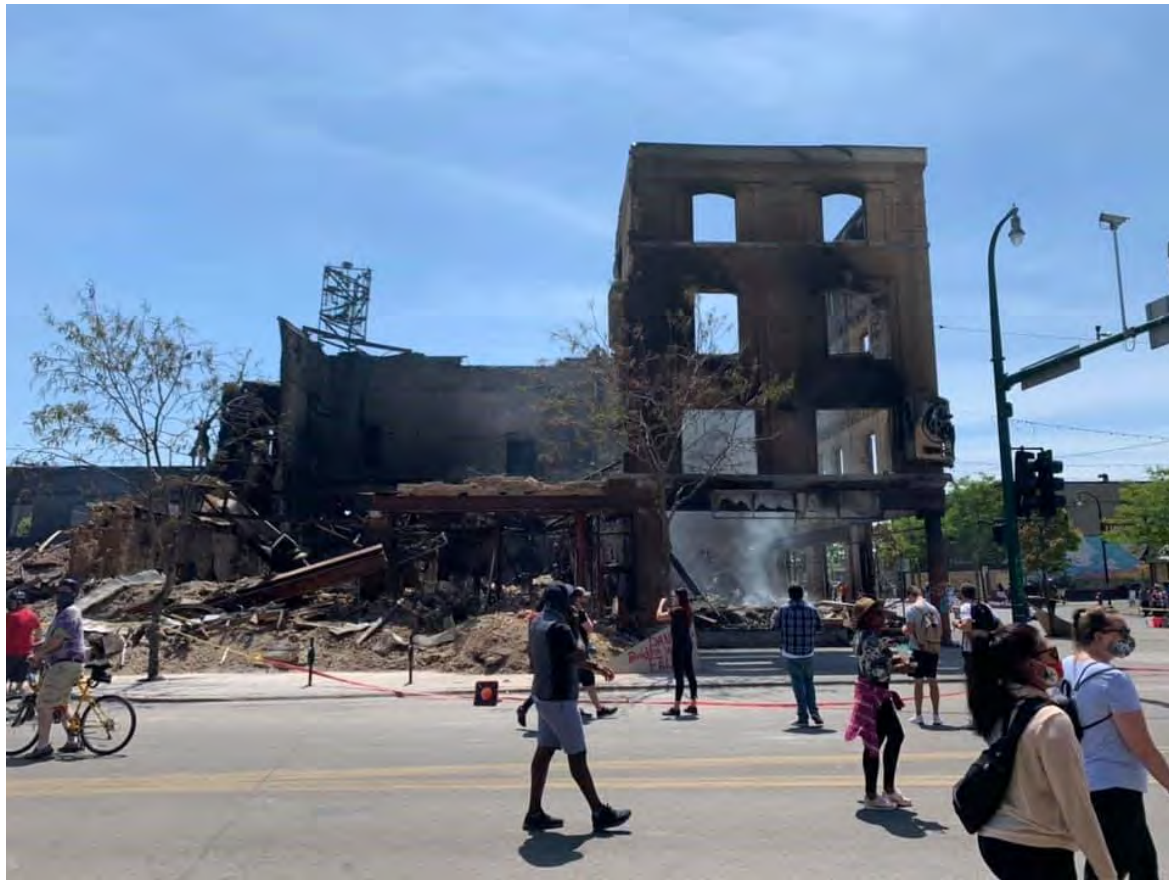
Lake Street and 27th Avenue