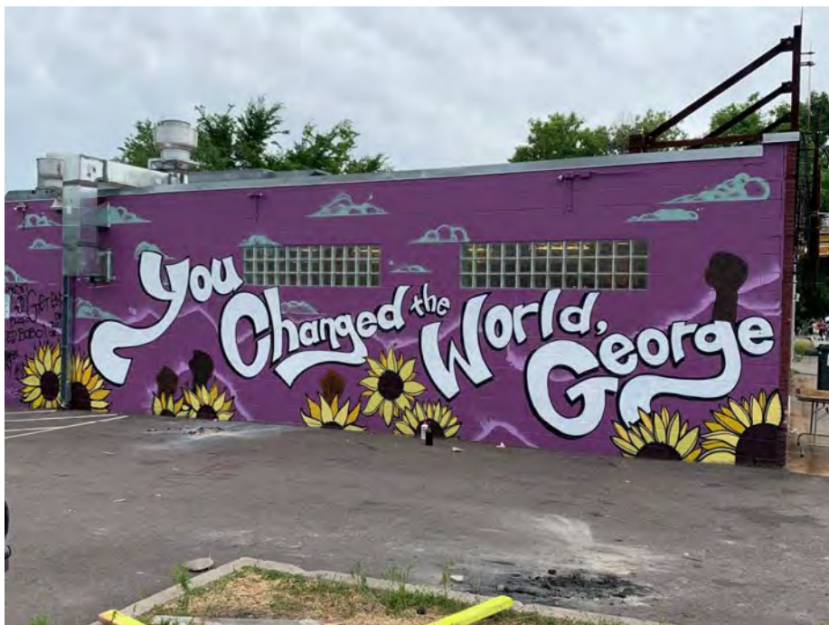
Mural on a business at 38th St. and Chicago Ave