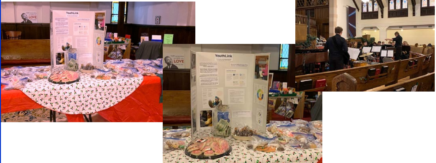
Scenes from the Christmas Pageant at Judson Church on December 15, 2019