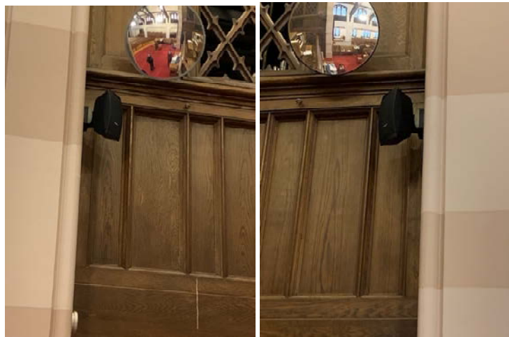
New speakers in the choir loft on the right and left