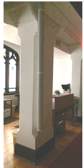
New speakers in the sanctuary.