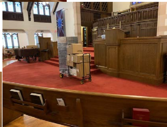
New wireless mike and lectern mike